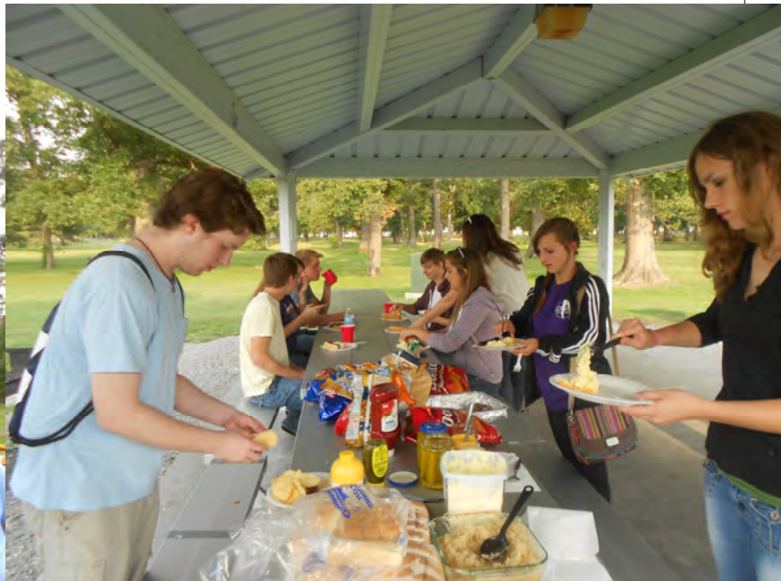
Above, students of the World Language Club enjoying some authentic cuisine during the Oktoberfest celebration.

Please patronize and help us thank our LOHS Positive Behavior Sponsors