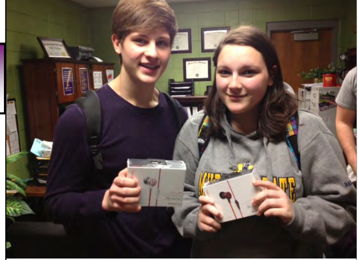
Perfect attendance in December winners each received a pair of Beats by Dr. Dre ear-buds. Winners were drawn from those that had not missed a day all month.