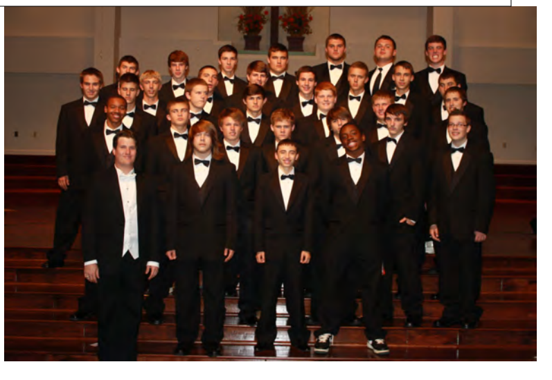
Follow the LOHS Choir on Twitter- @lohschoir