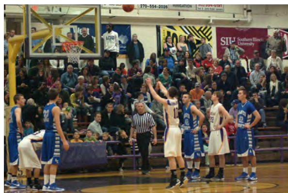
The boys fought hard but came up short on homecoming.