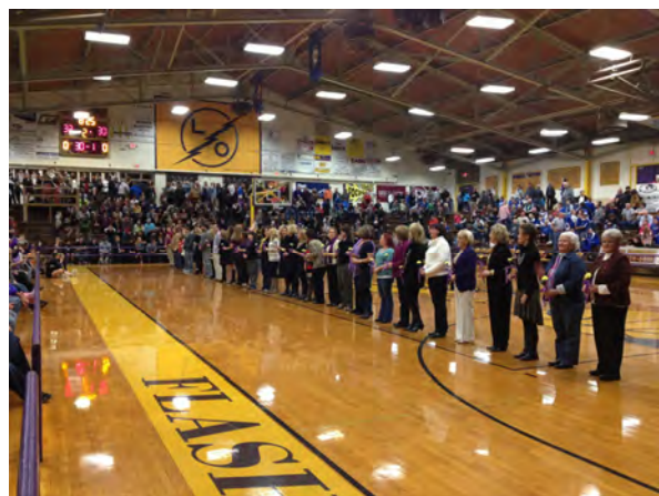
Former homecoming queens of LOHS gather on the floor.