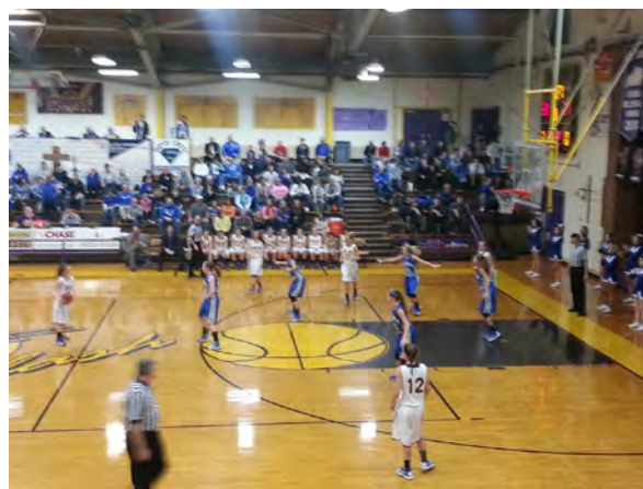
The Lady Flash beat Graves Co 55-46.