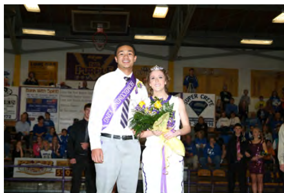
The final King and Queen of LOHS.