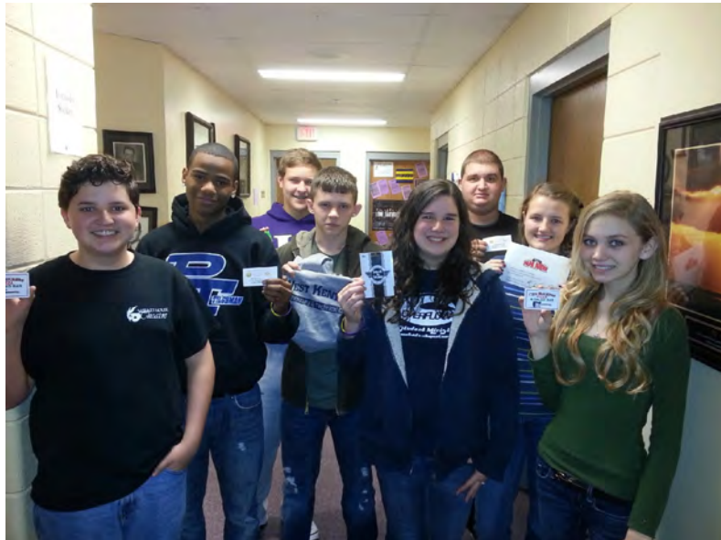
Each week, iTunes cards, Papa John's gift cards, Parker's Drive-In certificates, and City Rockers Pizza gift cards make up some of the prizes we give away for good behavior.

Major discipline referrals dropped from 5.2 to 3.76 per day, while the overall number of referrals per day dropped from 8.8 last year to 7.17 this year.