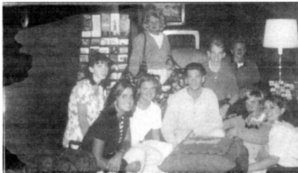
FBLA members arriving at the conference