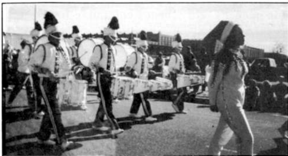
Left: The Kentucky Colonel Band struts its stuff in the Paducah Holiday Parade.