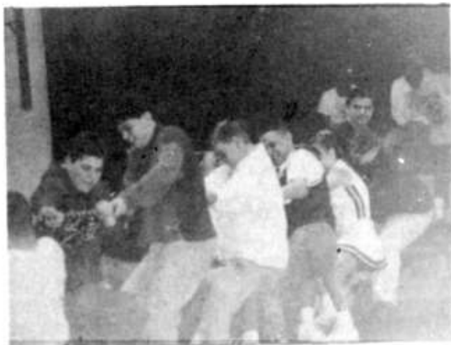
Freshmen guys try to beat the upperclassmen in Tug-o-war during a pep rally.