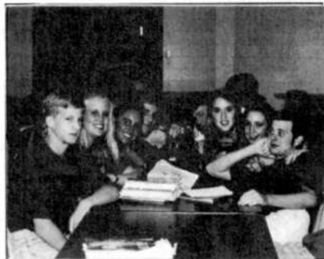
Sophomores sit around and guard the one remaining agenda in the school.

What do you think were the biggest trends of the past school year?