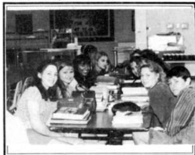
Freshmen members of FBLA gather at the May meeting.