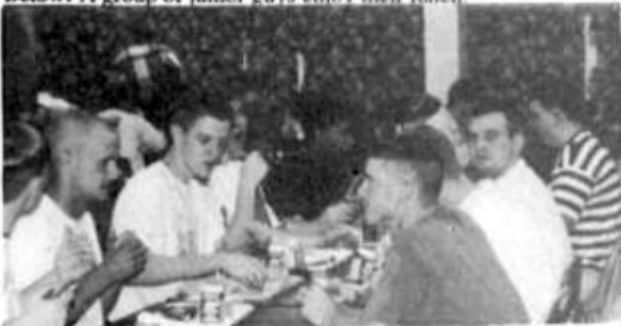
Below: A group of junior guys enjoy their lunch.