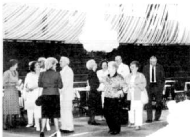
Senior citizens enjoyed the prom decorations as they were treated to their own "Prom" on Friday, April 27.