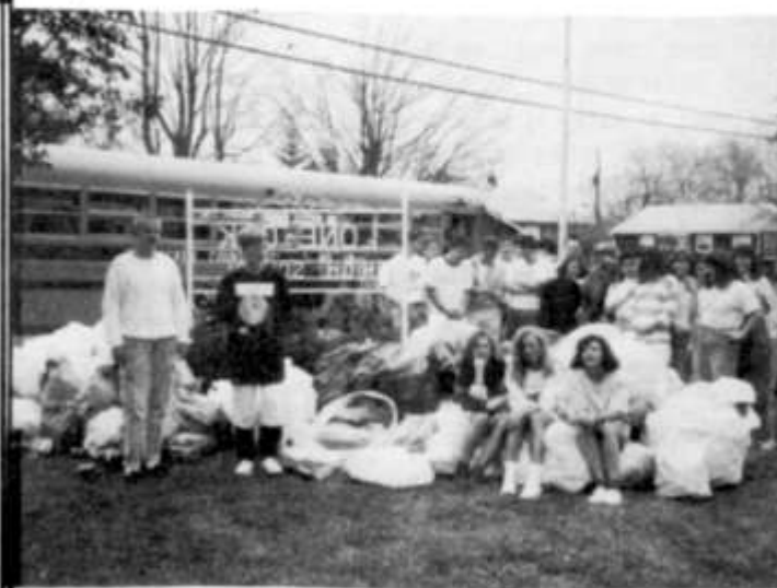
Lone Oak students pose with over 1000 lbs. of recyclables collected for Earth Day 1990.