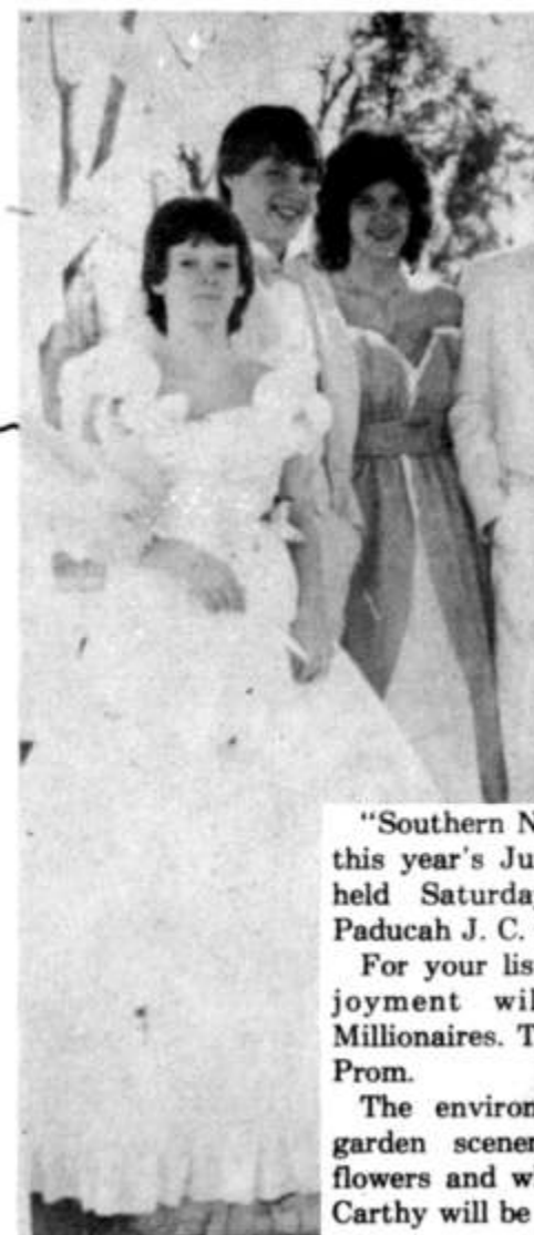
"Southern N this year's Ju held Saturda Paducah J. C. For your lis joyment wil Millionaires. T Prom. The environ garden scener flowers and w Carthy will be