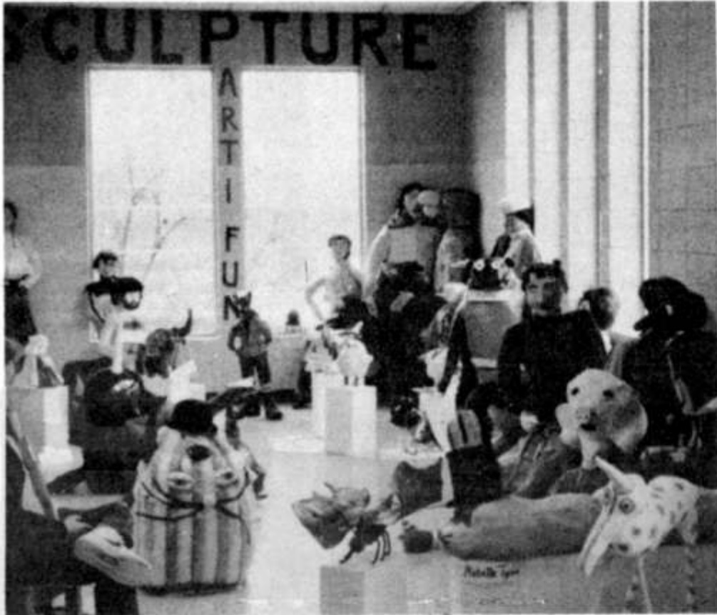
Finished product of art classes' sculpture art