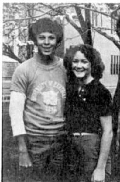
Couple of the month