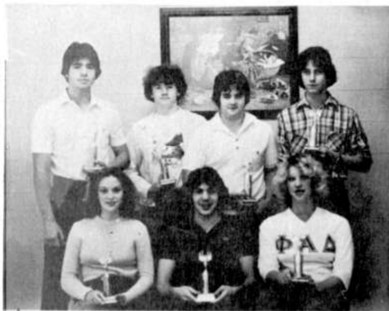
Deca's Parliamentary Procedure team.