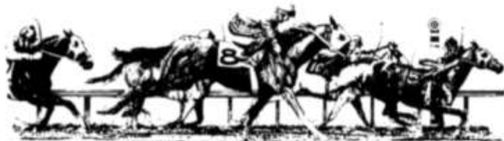
Be in the Winner's Circle with Lone Oak Trophy House