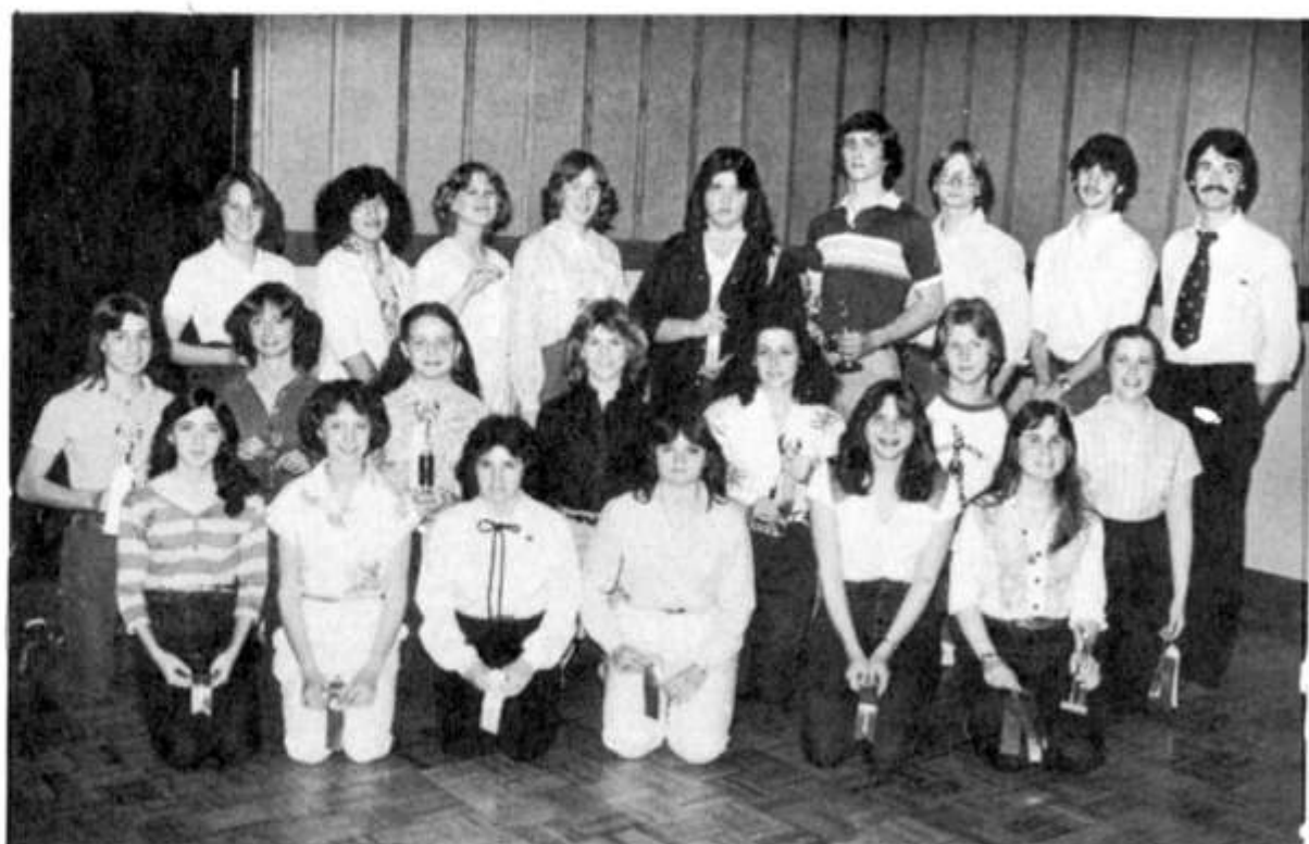
Foreign Language Festival Winners