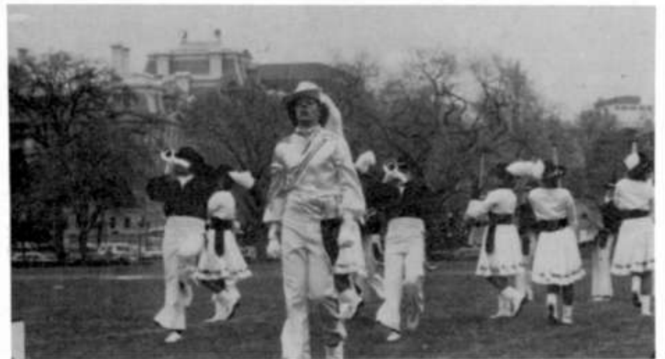
Only a few more minutes and it'll be all over.