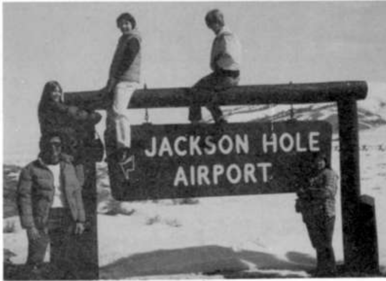
Students show excitement on arrival to Jackson Hole.