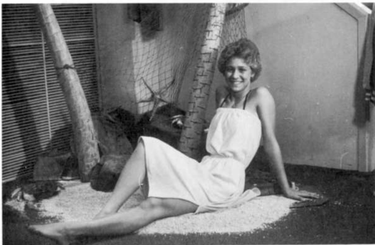
Even with a cover-up by Sassafra, Robin will still look great on the beach soaking up the sun.