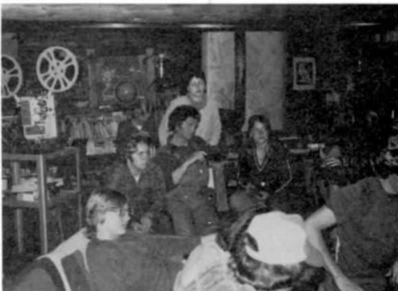
Students take interest in Biological films.