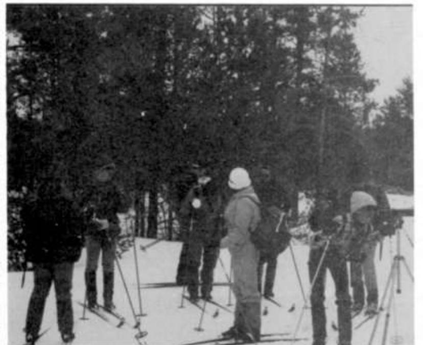
Last minute instructions before rolling in the snow.