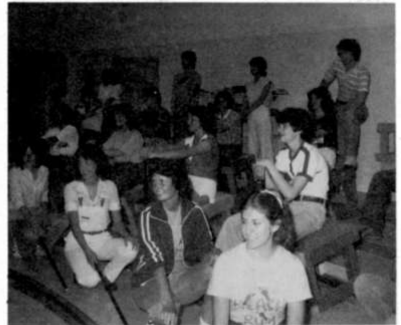
Swing Choir practices on "Sounds of Spring".

The local program is sponsored by the Paducah Area Chamber of Commerce and Peoples, Paducah, and Citizens Banks. The University of Kentucky College of Agriculture Cooperative Extension Service and the Kentucky Council of Cooperatives sponsor the program at the state level.