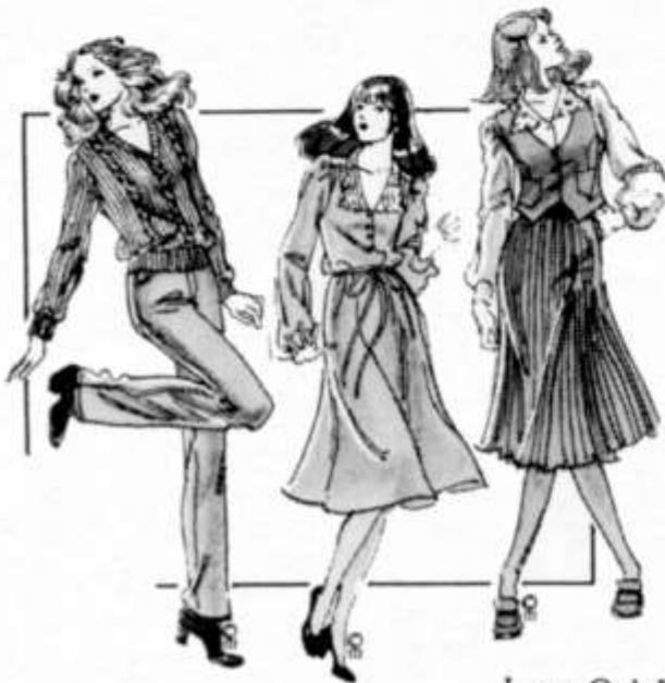
Lone Oak Plaza