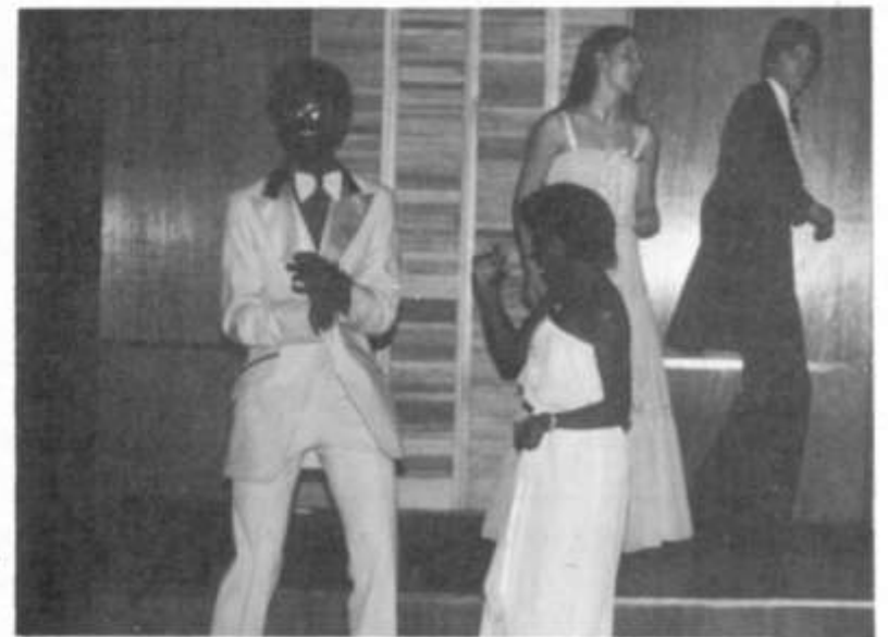
Enjoy yourself, it's prom!