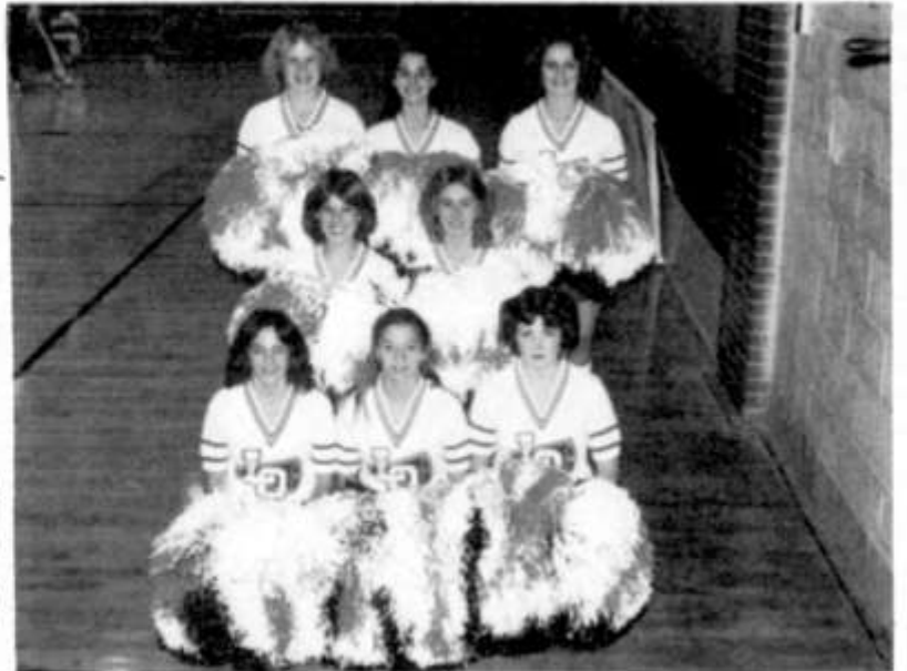
The Varsity cheerleaders competed in the annual district cheer-leading competition at Ballard Memorial.

For Sale: '78 Firebird Espirit, Silver w/Red Velour Interior, AM-FM Stereo Tape, Auto., Air, 14,000 miles. 898-7494 or 554-3566.