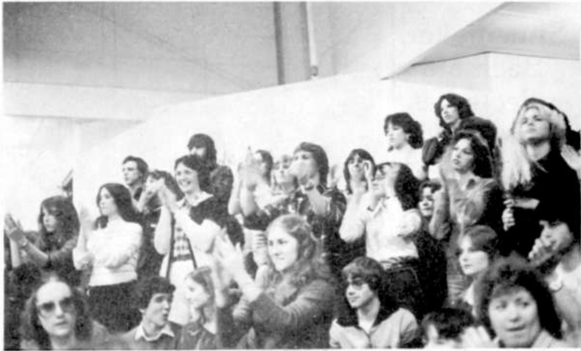
Lone Oak fans show support during the Lone Oak-St. Mary game.