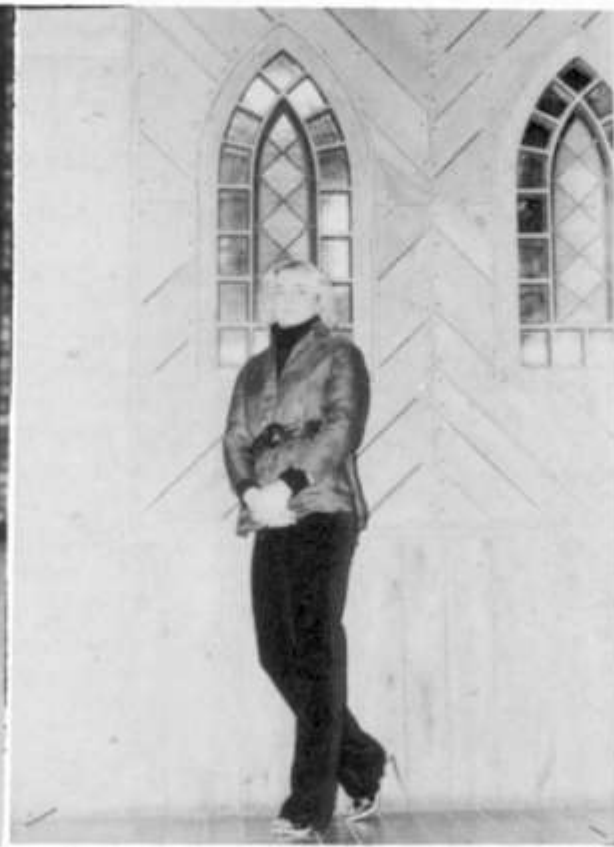
Sherry catches plenty of holiday glimpses wearing something such as this outfit by Charm. The Aigner shoes really help set it off.