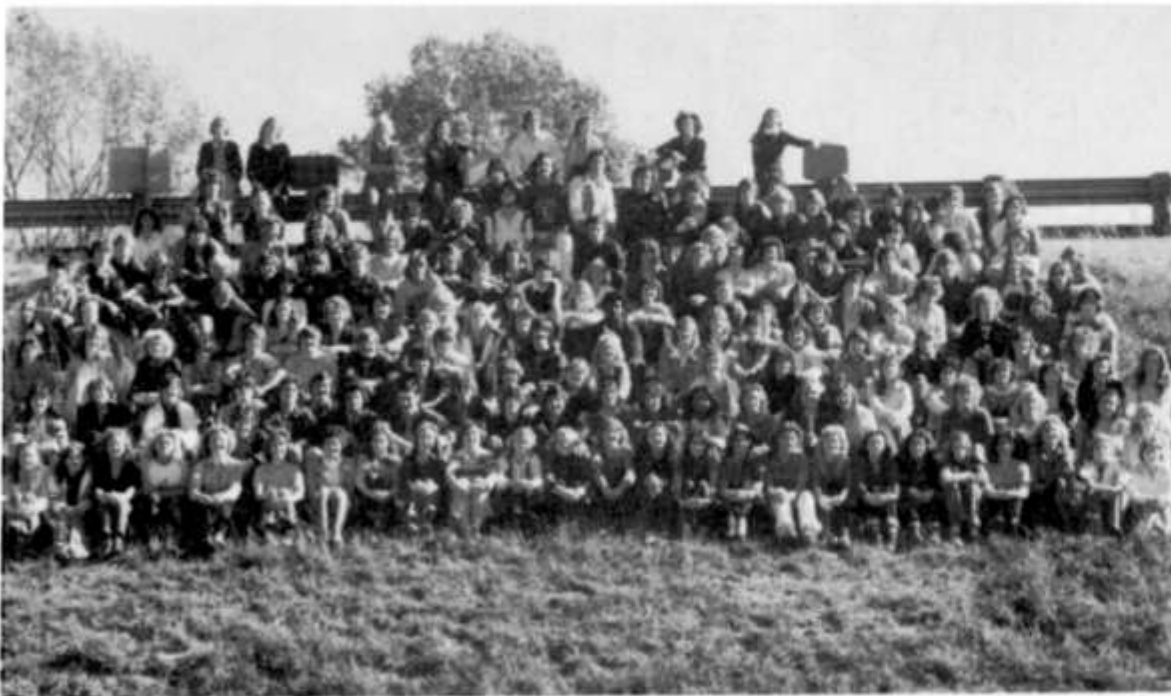
Seniors would be proud of this picture of the senior class. The photo was made by the I-24 overpass in keeping with this year's yearbook theme.