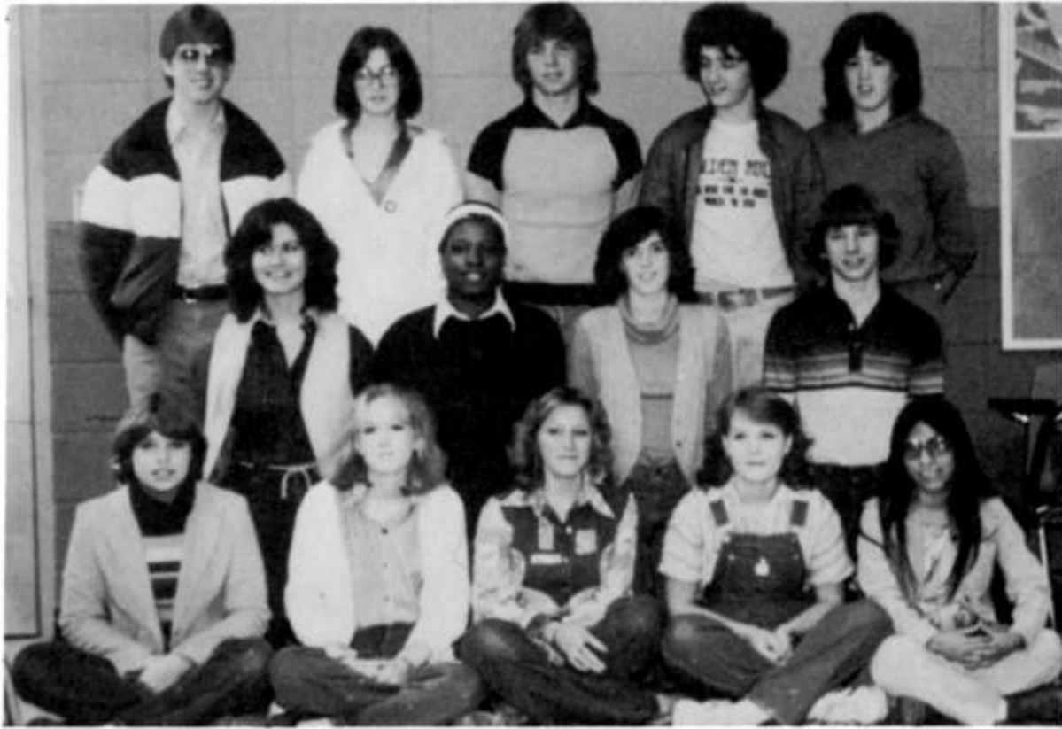
This year's 16 new juniors who were not previously enrolled in L.O.H.S.