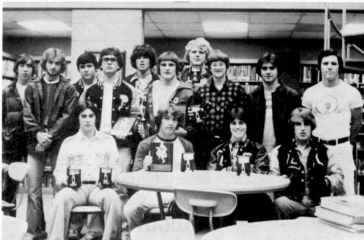
Football Banquet award winners