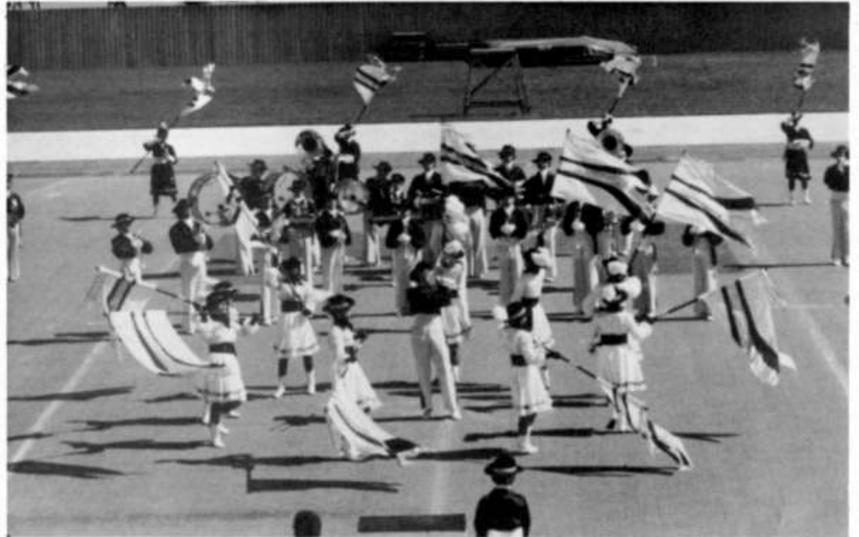
The Colonel band shows off at Murray Festival of Champions.