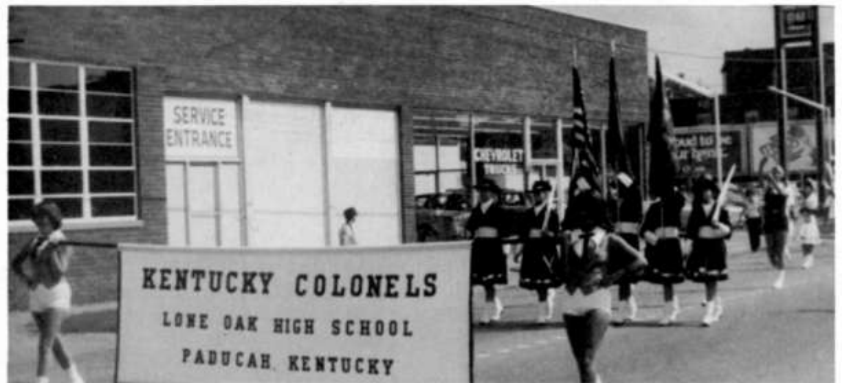
Colonels in the Paducah Labor Day Parade.