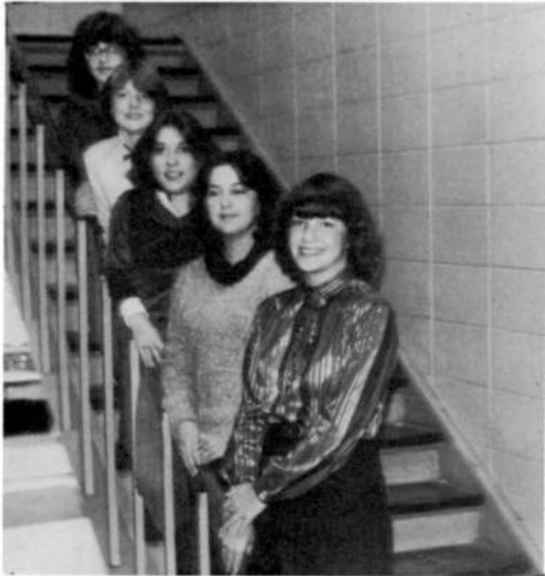
1979 K.U.N.A. Delegates