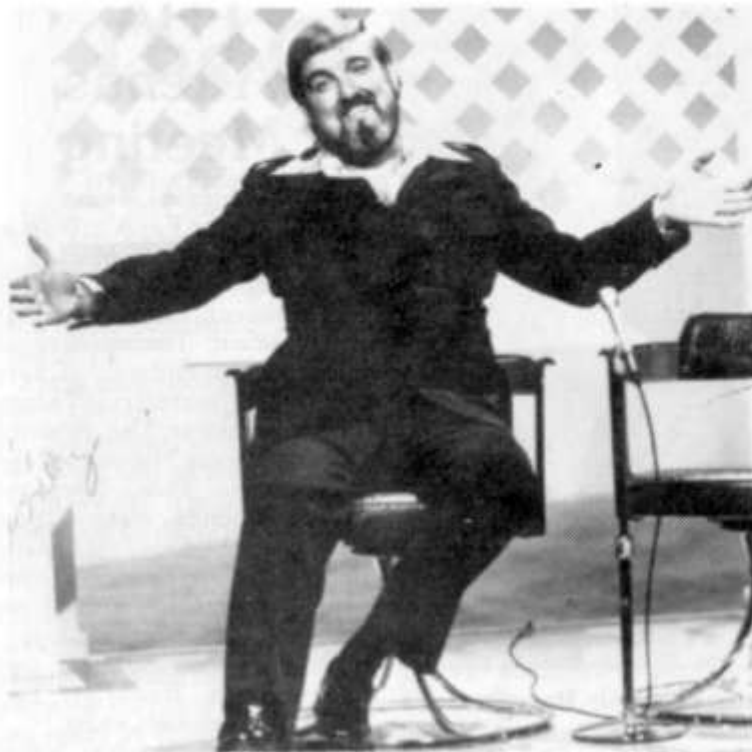
Emcee Ralph Emery