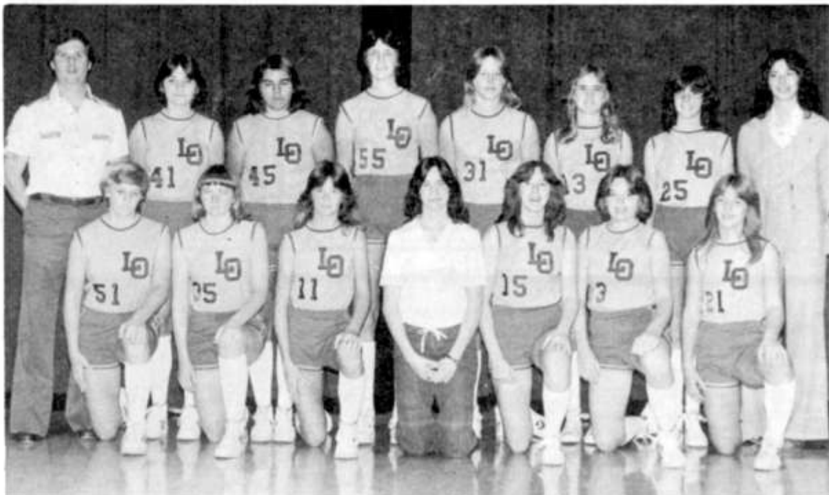
1978-79 Lady Flash Basketball Team.