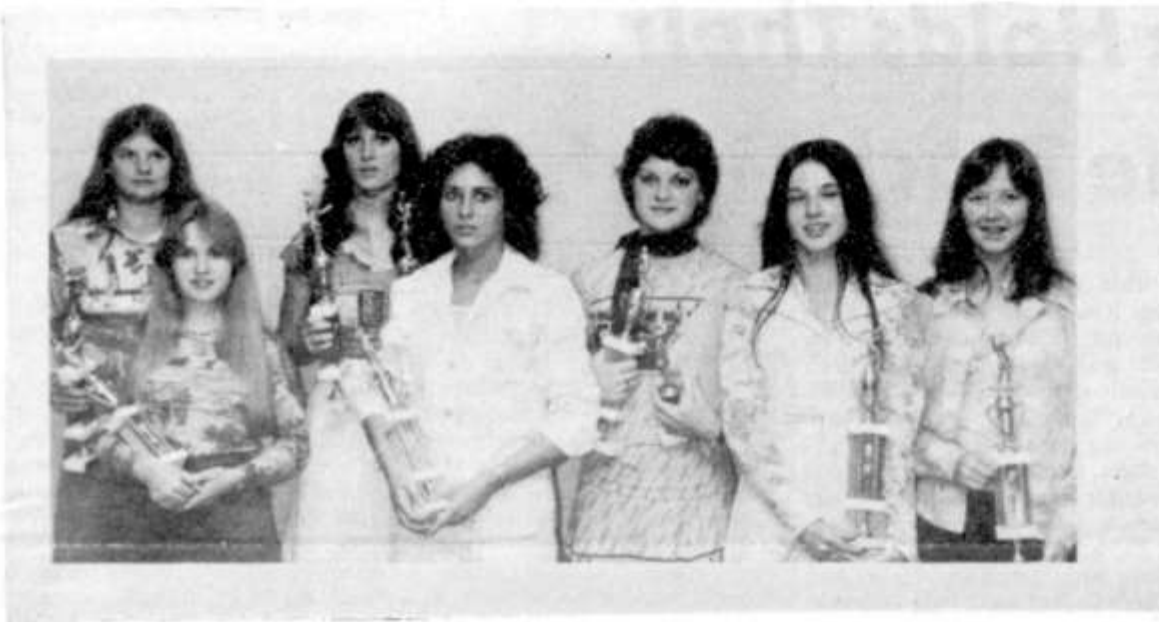
VARSIITY GIRLS AWARDS