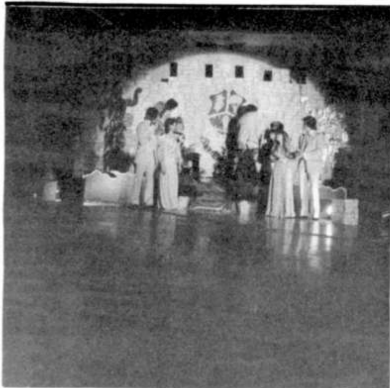
The moment everyone waited for, the crowning of Prom King and Queen.