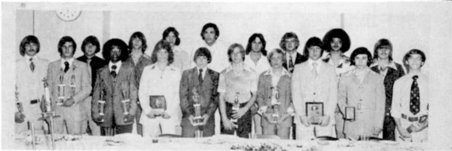
LONE OAK VARSITY BOYS AWARD RECIPIENTS