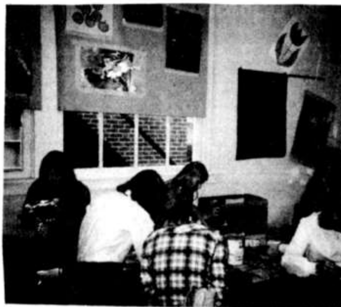
MANY JUNIORS are working hard on the decorations for the 1976 Junior-Senior Prom. The dance will be held at the JayCee Civic Center, May 7, starting at 9:00 p.m.