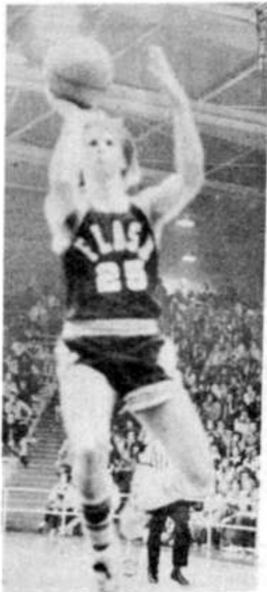
Montgomery sinks two