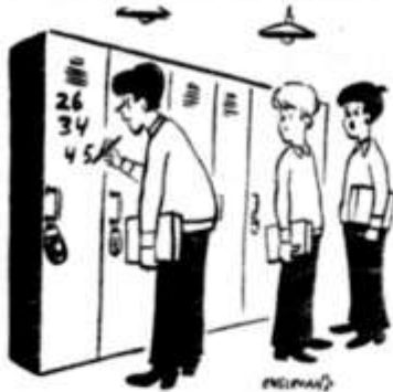
"He has trouble remembering the combination."