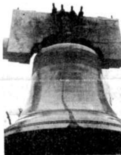
Replica of the Liberty Bell