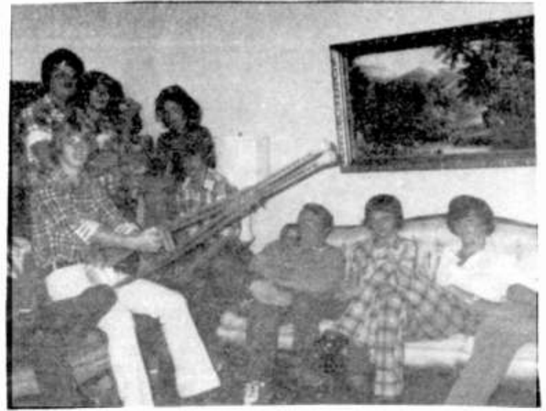
Lone Oak men learning how hard a woman's work really is.

ACT TEST DATES Oct. 18 (Aug. 18-Sept. 22) 1975 Dec. 13 (Oct. 20-Nov. 17) 1975 Feb. 14, 1976 (Dec. 15-Jan. 19) Apr. 10, 1976 (Feb. 16-Mar. 15) Jun. 12, 1976 (Apr. 12-May 17)