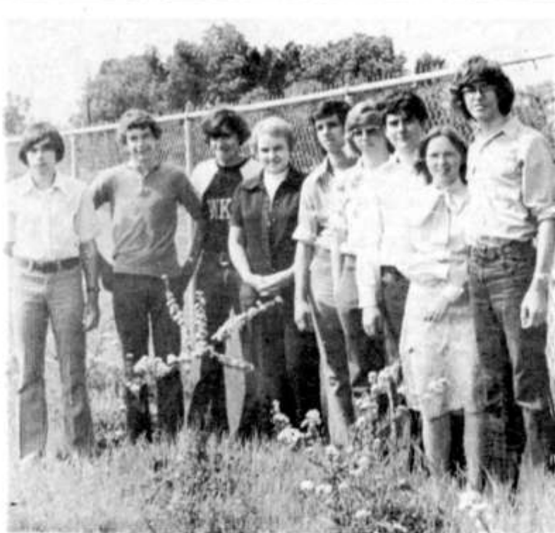
MEMBER OF BIOLOGY CLUB pose behind bushes planted at LOHS football field.