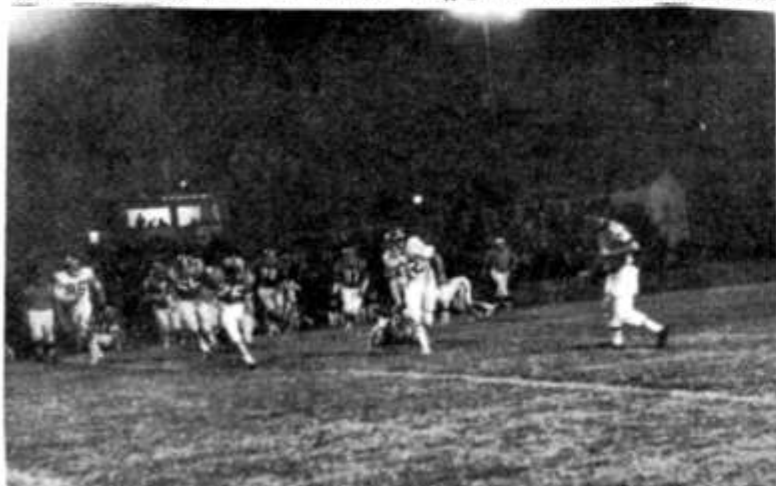
REEVES BREAKS LOOSE for gain in Lone Oak-Reidland game.