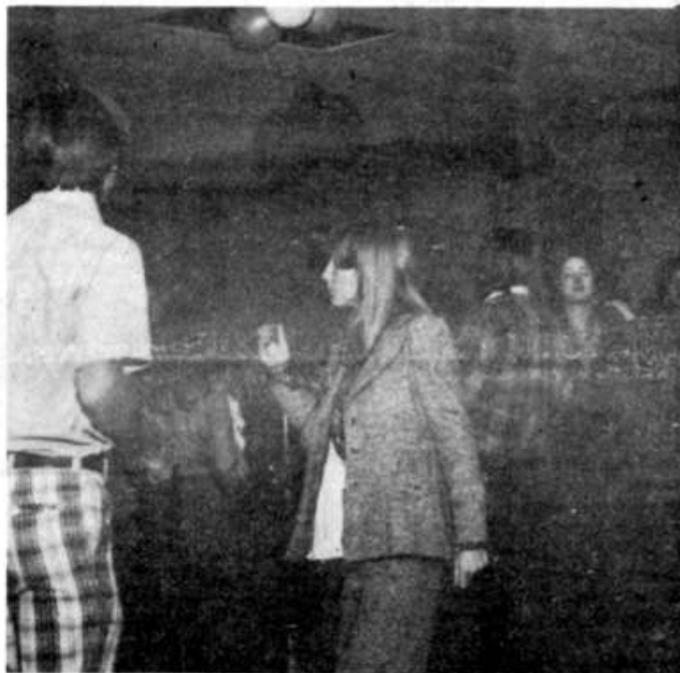
LOHS STUDENTS dance to music of "Freefall."