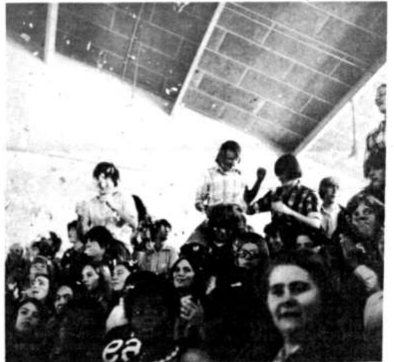
BLIZZARD IN OCTOBER?