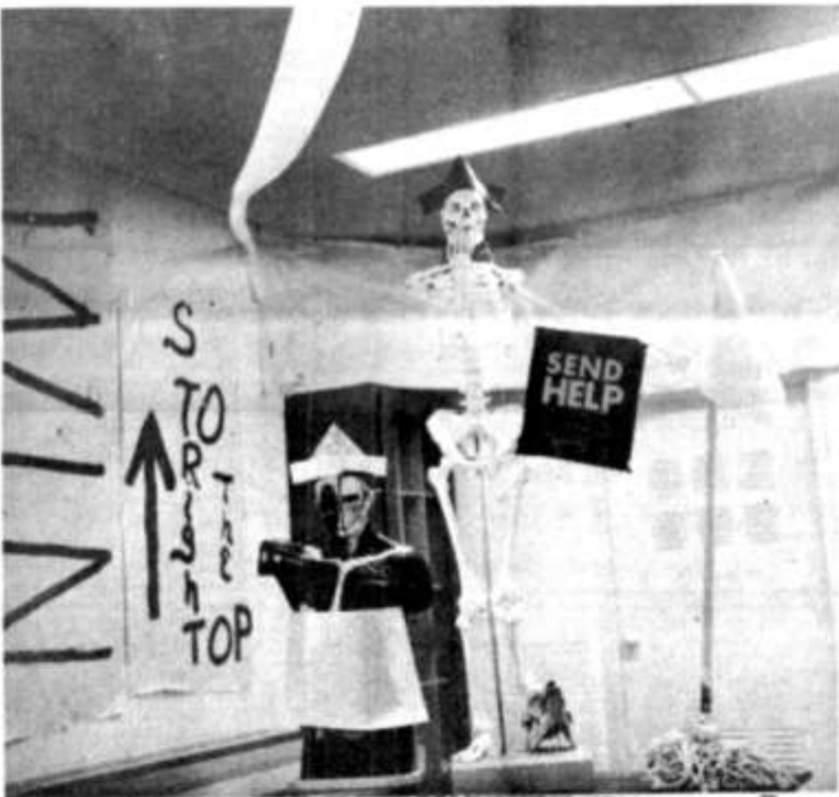
WE SKINNED THE PIRATES

The bonfire was held directly after the Freshman football game and there were plenty of students and parents there to back the Purple Flash. As the fire got higher so did the spirit. And the Purple Flash was raring to go to beat the Heath Pirates the following night. The bonfire was a success and so was the game because now we are the County Football Champs.