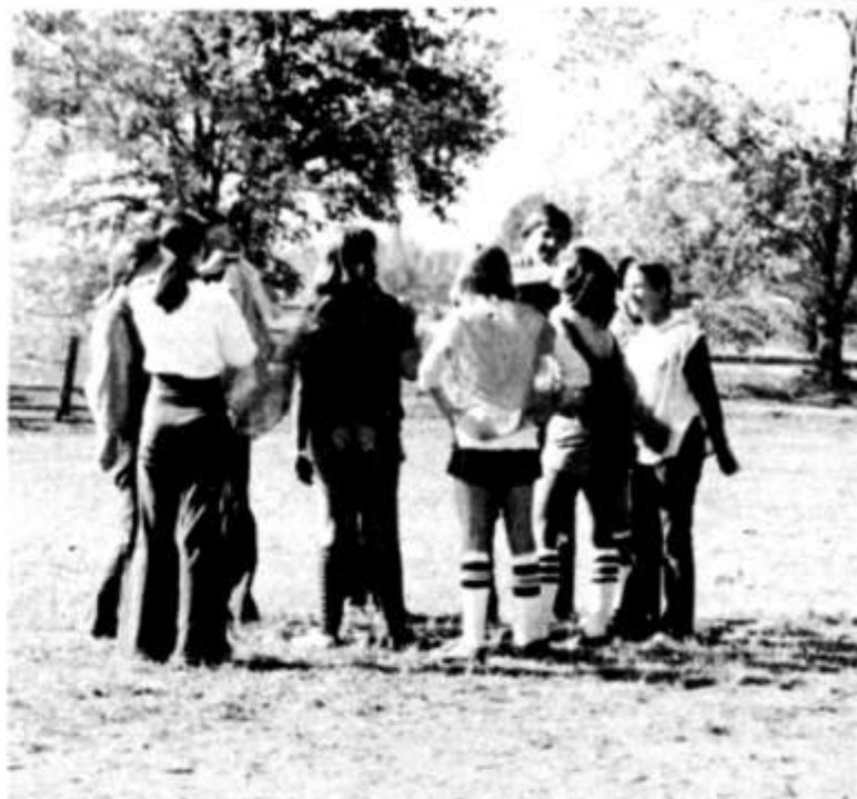
JUNIOR GIRL stops for well-deserved rest.