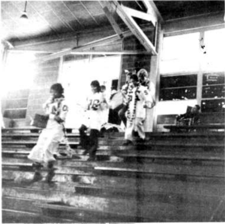
TEACHERS RAISE spirit at big pep rally.