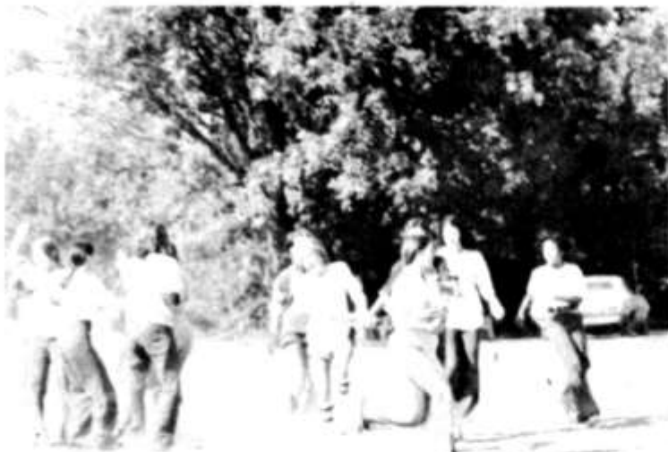
ACTION IN annual powder-puff game.