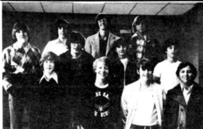
Members of 1974 Lone Oak tennis team.