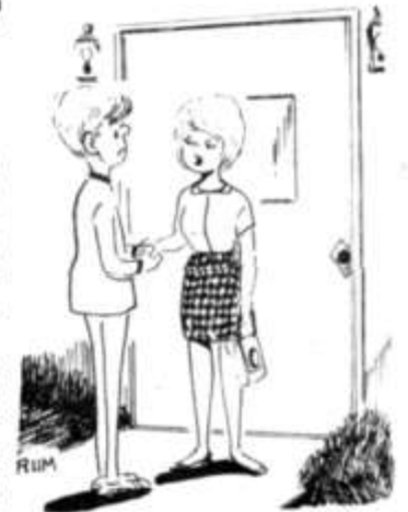
"I had a wonderful evening, John, but this wasn't it."

At half time of the Tilghman-St. Mary game on March 1, Heath was announced as the number one cheerleading squad in this district. Tilghman was named second, Lone Oak and Reidland placed third and fourth respectively.