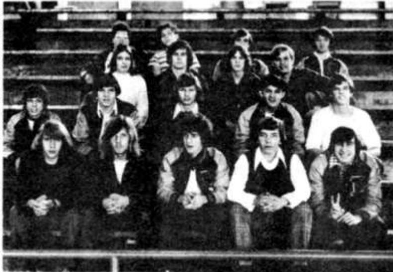
Oakers baseball team will soon open season.