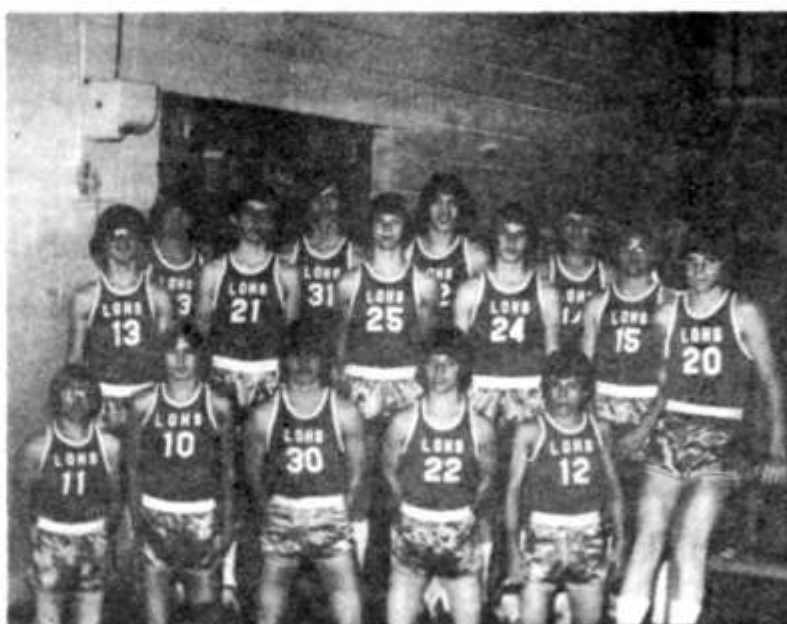
Purple Flash Freshman are Regional Champs!