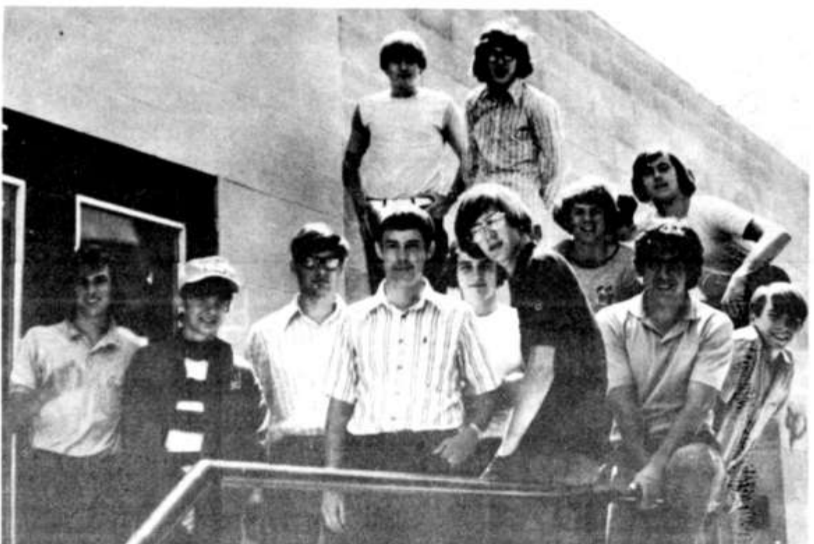
Boy's Tennis Team relaxes after practice.