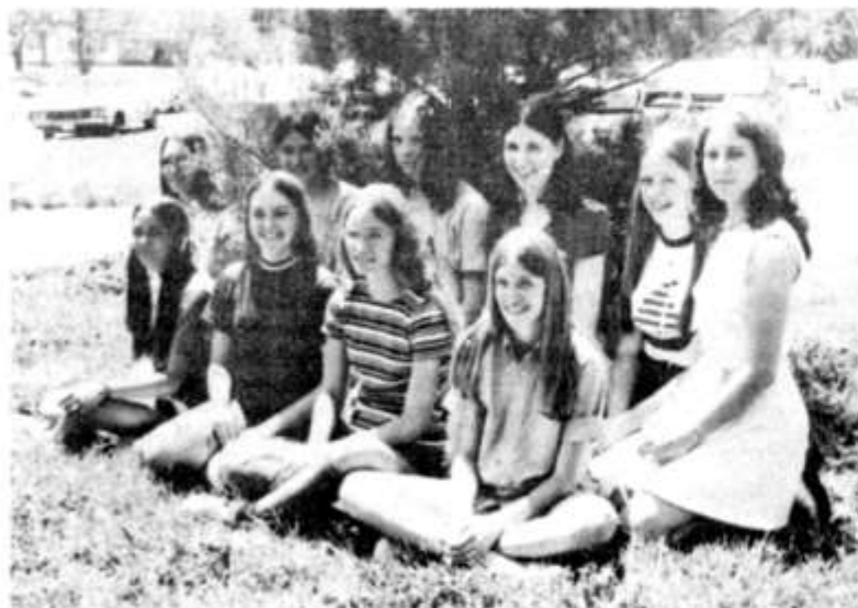
GIRL'S TENNIS TEAM pauses for picture.