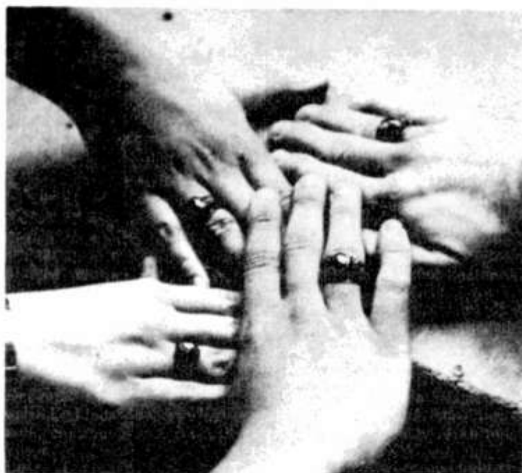
PROUD JUNIORS SHOW off new class rings.