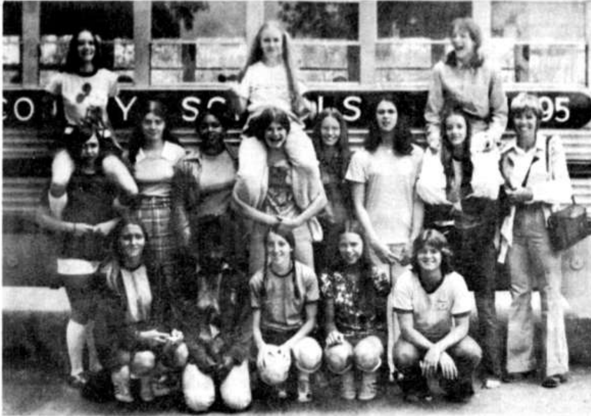
Girls pose before big meet.