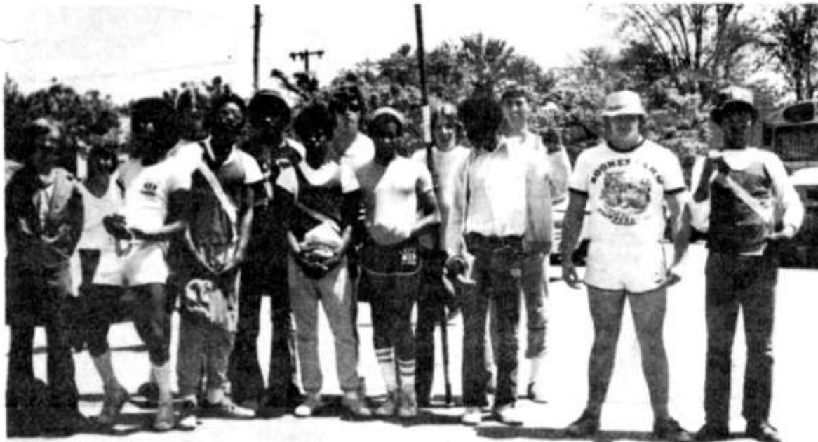
Track guys break from hard work.