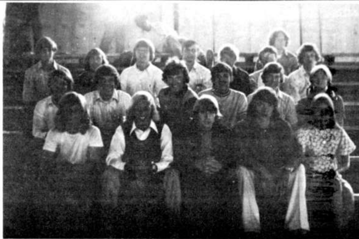
Lone Oak's Fantastic Baseball Team