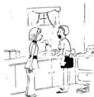
"Get a haircut, dear. You look like a boy."

When you are walking down the hall and a door opens and smacks you in the face.