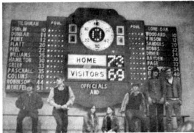
FINAL SCORE Lone Oak 73 Tilghman 69