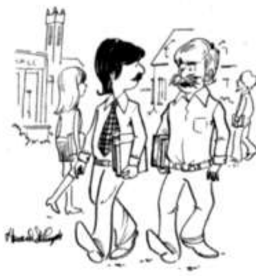
"I just washed my mustache and I can't do a thing with it."

SILLS FOOD CENTER 3901 Schneidman Rd. Paducah, Ky. 42001