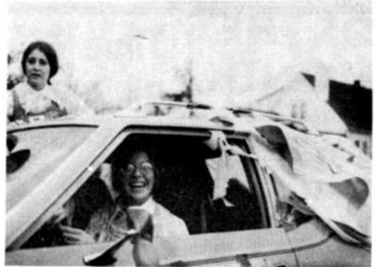
Lone Oak's Victory Parade

The meeting was adjourned with the Friendship Circle.