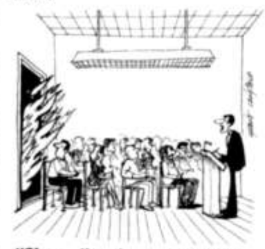
"Class, I've been asked to make the following announcement..."

You can obtain single copies of "Photo Reports Make It Happen" free of charge by sending a self-addressed envelope (no stamp necessary) to Dept. 841, Eastman Kodak Company, Rochester, N. Y. 14650.