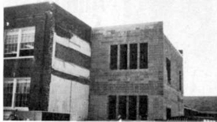
Construction underway on new building