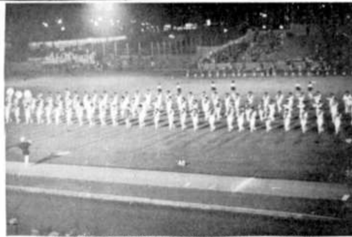
KENTUCKY COLONELS MARCH AT CONTEST