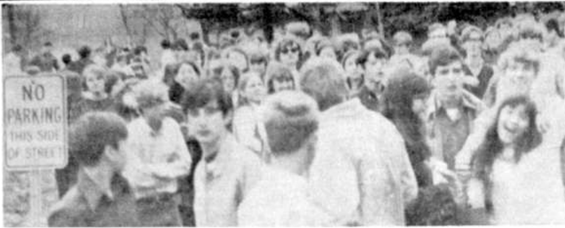
Students wander on College Avenue during the bomb scare before being allowed into the gym.