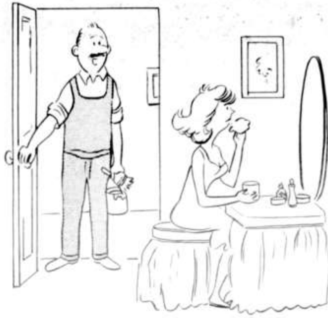
"While you're getting ready, your boy friend can help me paint the living room."