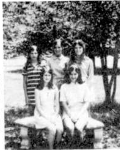
B Team Cheerleaders