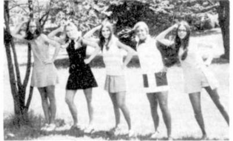
A Team Cheerleaders