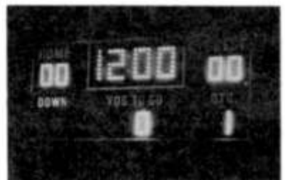
The new electric scoreboard in Brooks Stadium makes data on the game instantly available to football players and fans.