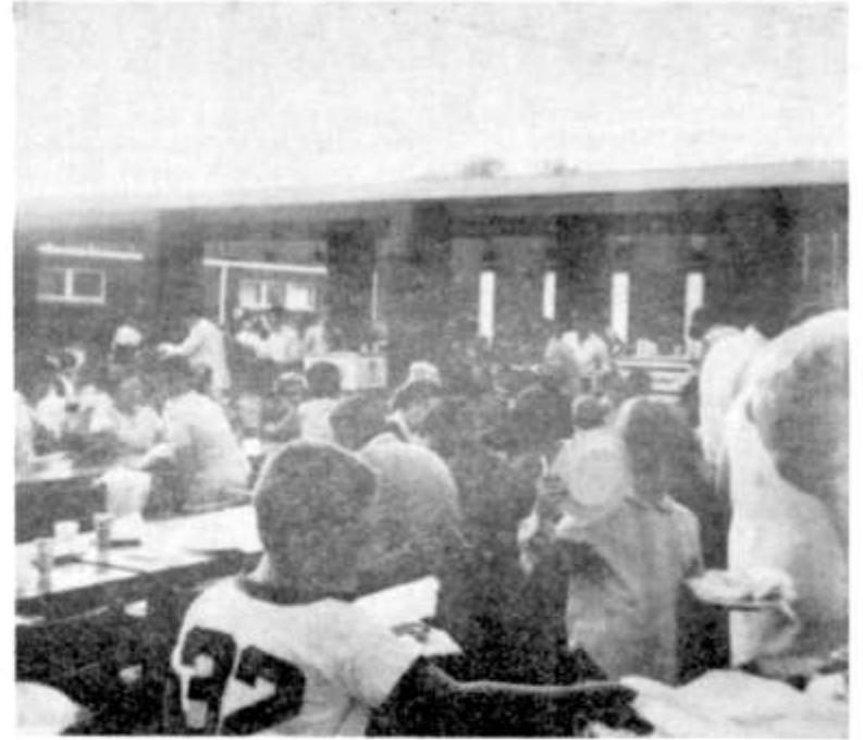
Large crowd enjoys cake, ice cream and sand sandwiches while the bands perform.