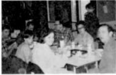
Dinnertime is a welcomed time in the woods.

Some of the more energetic young people took hikes before breakfast and therefore had to rise several hours before the planned 6:00. Breakfast was served at 7:30. All meals served