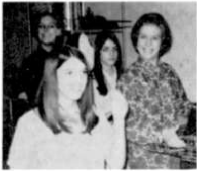
Even K.P. can be fun on a camping trip to LBL.

LBL Trip from Page 3 which date back to the late 1700's.