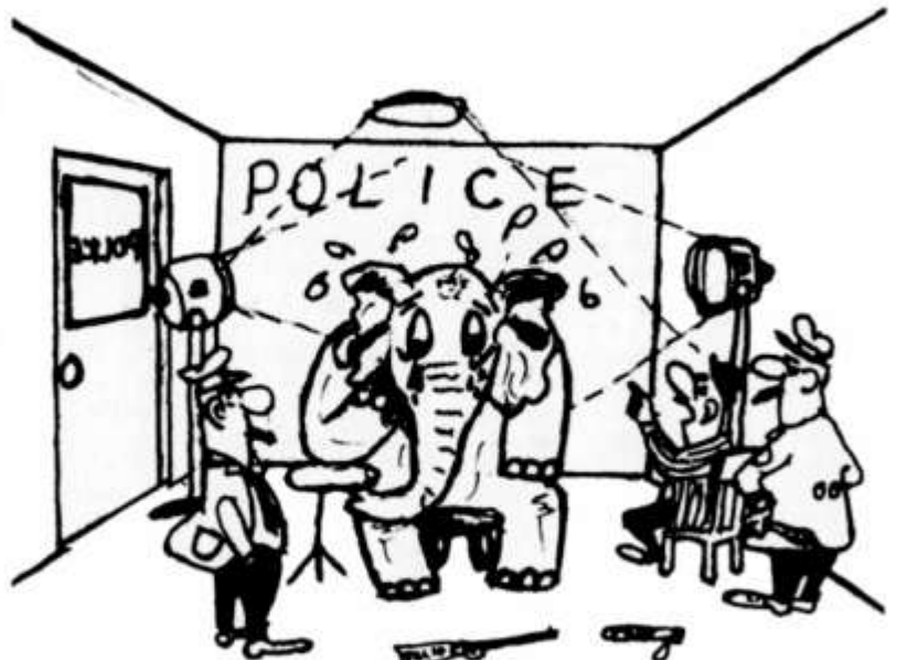
"But did you see anything UNUSUAL on the choir bus?"

Name: Alan Flake Class: Senior Favorite Color: Blue Favorite Movie: "For a Few Dollars More" Favorite Song: "Love is Blue" Favorite Food: Broiled shrimp Favorite Saying: "Cram it" Ambition: To sail the 7 seas Pet Peeve: 9 in a Valiant