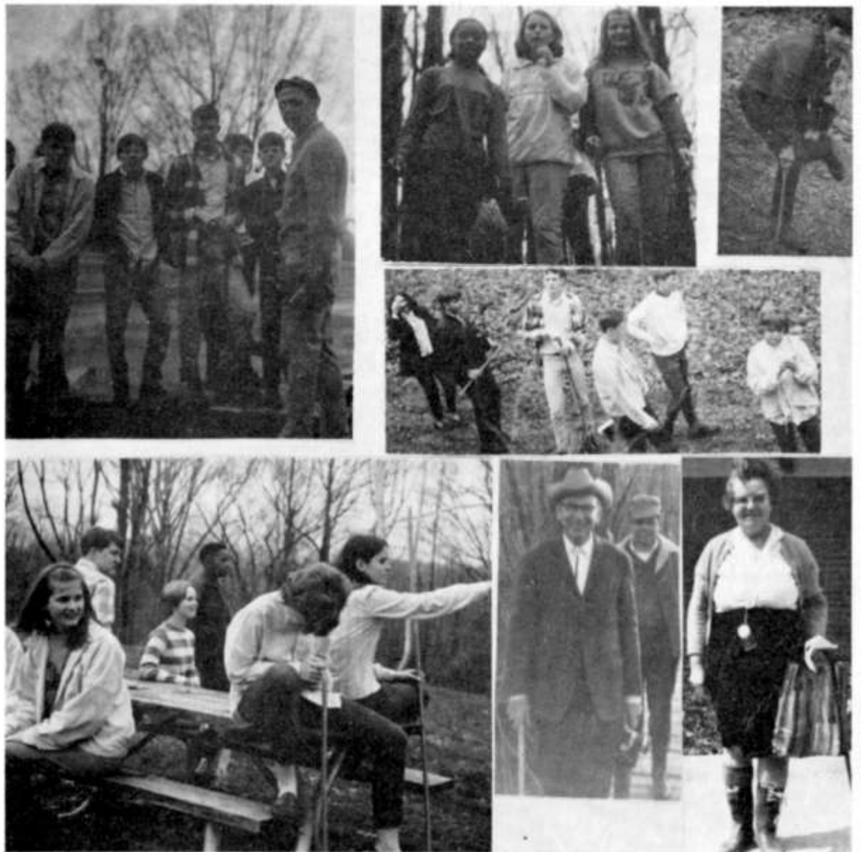
These are some candid pictures of the LBL hikers and their leaders during some of the exciting and strenuous activities of their stay in the educational area.