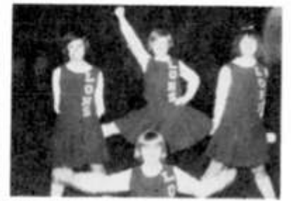
LOHS cheerleaders offer pep and enthusiasm all year.