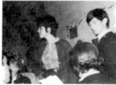
Journalism students pose problem for guidance counselor.

Val Moore led all scorers with 26 points followed by Jimmy Clapp of South with 21. Following Moore for Lone Oak were: McIntosh-13, Smith-10, Hodges-8, Roussel-7, Hooper-2, and Via-1.