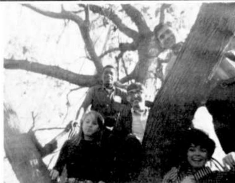
Student Council officers aren't up a tree, they're attempting new heights for Lone Oak for '67-'68.

The music performed at Quad-State Music Festival will also be performed by the City-County Choir in the Paducah Fine Arts Festival November 18 at Tilghman Auditorium.