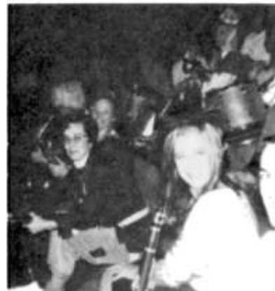
The Beatles they're not!

ing basketball. It's not whether we won or not, but whether there was money made for the John Robinson Scholarship Fund!