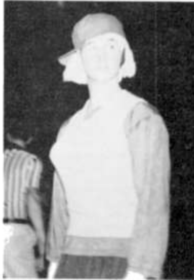
Is my mascara running?