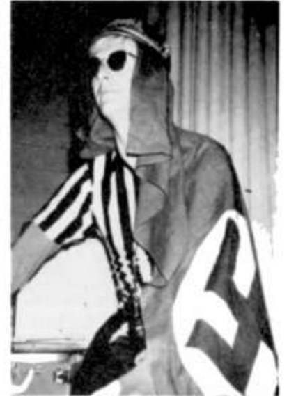
Baron Von Trentham is his name.