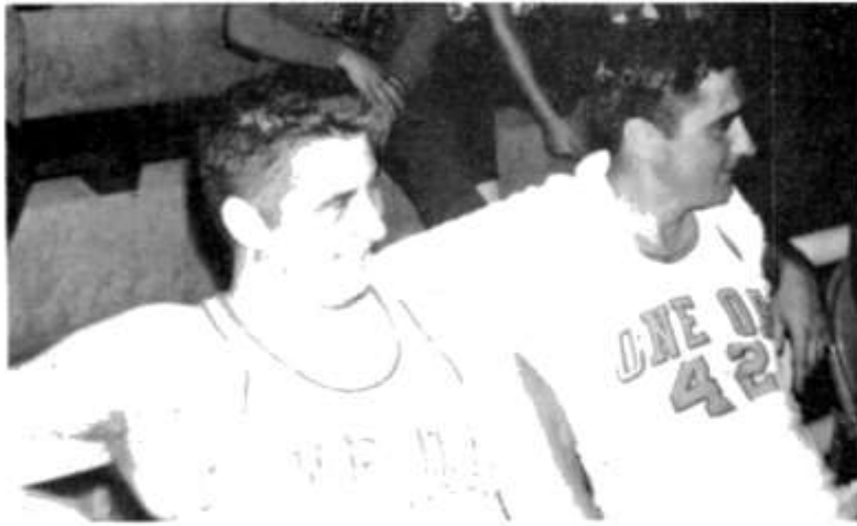
Stars smile for cheering fans.