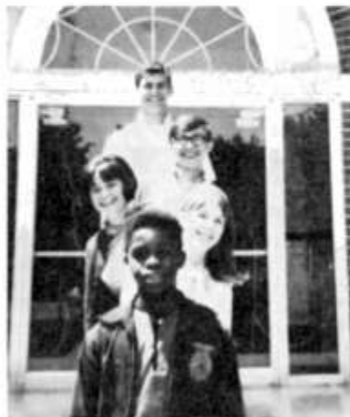
New Student Council Officers