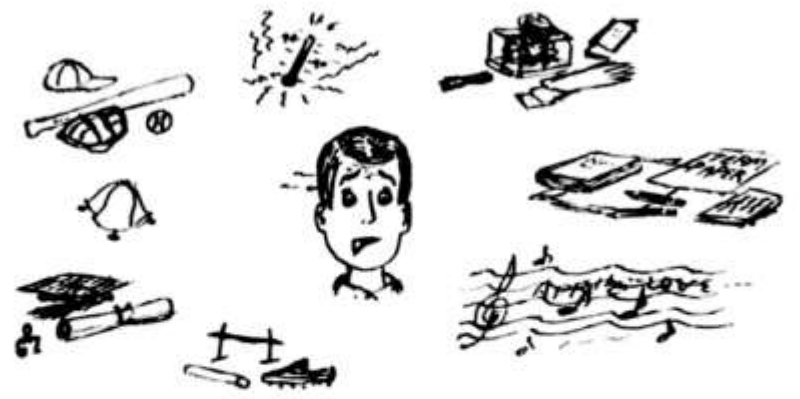
... and only 24 hours in a day!!