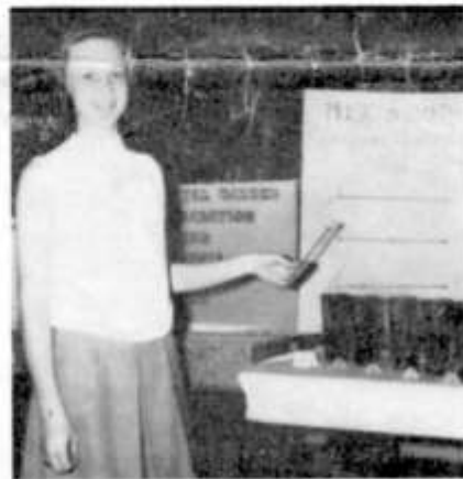
Pictured are only a few of the winners of the I. A. and Science Fair.