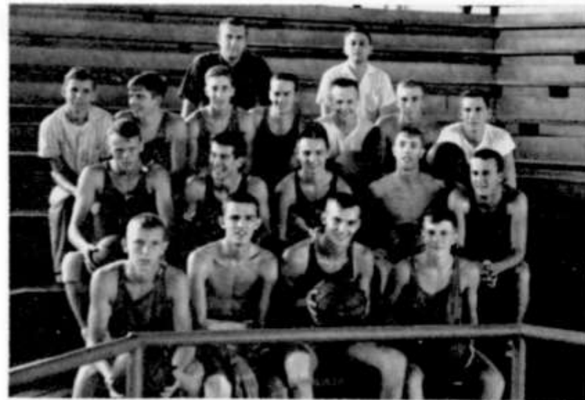
Basketball Team, 1964-1965

All boys are urged to participate in all sports that are offered in order for Lone Oak to have the best teams possible.