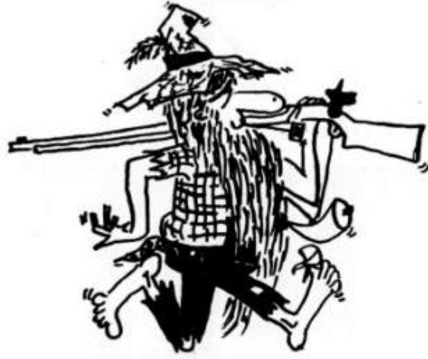
'63 Graduates Are On The Move

Also discussed were plans for a Beta Club dance. The decision was made to have the party on December 20, 1963. The dance will have a "Roaring 20's" theme and will be known as the "Roaring Beta Ball." There will be refreshments and a band at the dance, which will be held at the Knights of Columbus Hall.