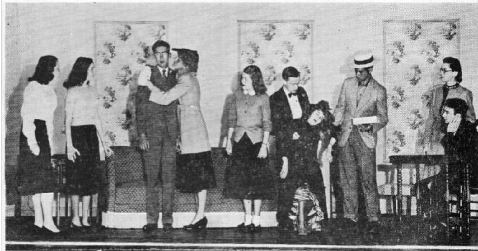
CAST OF SENIOR CLASS PLAY, "PROFESSOR, HOW COULD YOU?"