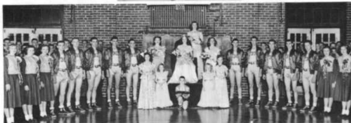
Our Queen and Her Court